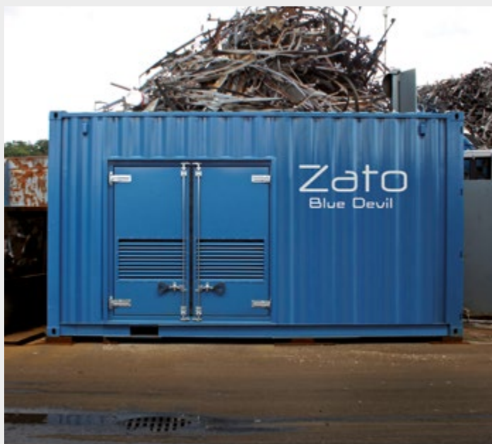
CONTAINER 40' mm. 12.120 X 2.450 X 2800 (MOTORE ELETTRICO CON INVERTER).

Service door with panic exit bar, main door. Internal lighting.